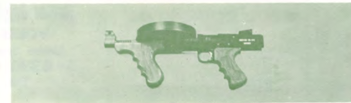
AM180 with Optional Short Barrel