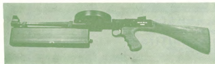
AM180 with Laser Lok Sight