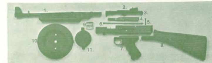
The AM180 can be disassembled and assembled without tools. 1. Barrel Group - 2. Receiver Top Strap - 3. Bolt - 4. Bolt Spring - 5. Receiver Top Retainer Pin - 6. Receiver - 7. Trigger Group - 8. Stock - 9. Feed Block - 10. Drum Magazine - 11. Magazine Drive