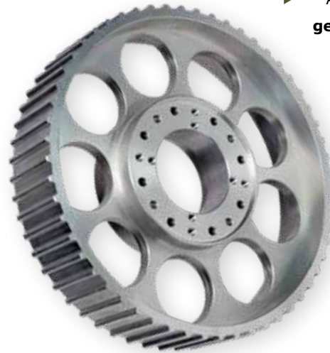
► Aluminium gear wheel